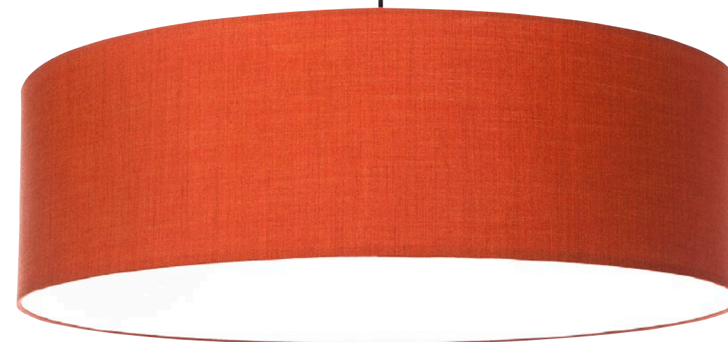
FAB WITH COVER REMIX 2 - 543

FAB - ● ○ ● - Ø 600 / 800 / 1100 MM - H 240 MM - CLOSED TEXTILE DIFFUSER