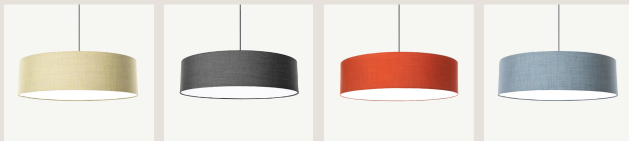
113 LIGHT BEIGE

REMIX 2 IS MADE OF 90 % PURE BRUSHED WOOL AND 10 % NYLON.